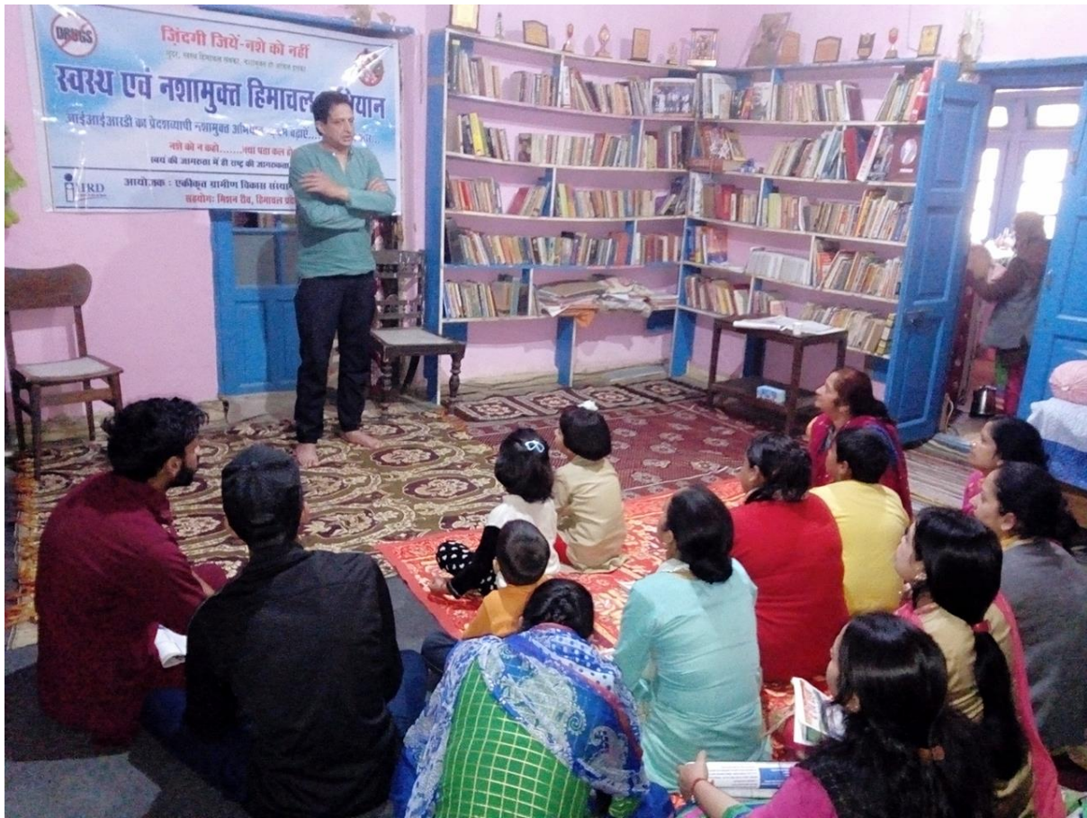
Anti-Drug awareness meeting being organised for people